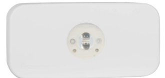
Lifelight SM Warehouse Lens