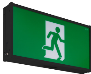
Theatre Jumbo Exit