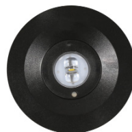
Lifelight Corridor Lens Emergency